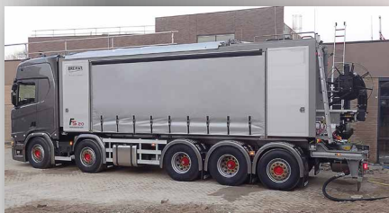
Machines from the BreMAT F-series can also be mounted on a truck chassis.