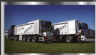
We are ready to help you with the best machines and optimal service!

Furthermore BreMAT delivers customer specified solutions for the mixing and pumping of several types of mortar, including EPS insulation mortar, foam mortar and PUR-materials.