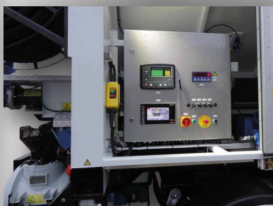
The computercontrolled system is easy to operate from the advanced touchscreen display.