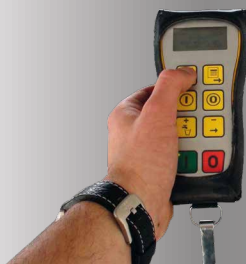
The installation can be controlled from the job site with the radiographic remote control.