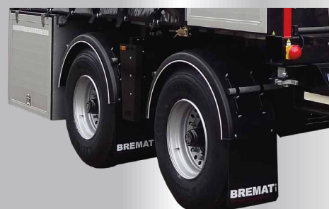
The 2-axle semitrailer complies to the most recent safety and quality standards.