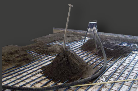
Sand, cement, water and additives are fully automatically mixed and transported to the workplace.

Beside cost savings and a guaranteed high-quality mortar production, the installation takes care of a significant improvement of the working conditions.